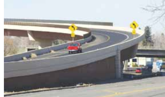
The 11-span bridge, which crosses Clear Creek, a bike path, and three traffic openings, plus eastbound and westbound I-70, and eastbound SH58, features a circular curve with a radius of 809-ft that transitions through a spiral curve to a tangent section.