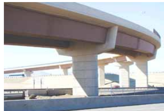
Integral pier caps on all fixed interior piers resolved clearance issues and presented a lighter, consistent visual appearance.

2115-FT-LONG PRECAST CONCRETE FLYOVER RAMP WITH MODIFIED CDOT U84 CURVED GIRDERS / COLORADO DEPARTMENT OF TRANSPORTATION, OWNER