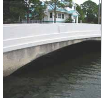
The Shore Drive Bridge was constructed in 1923 by the Luten Bridge Company.