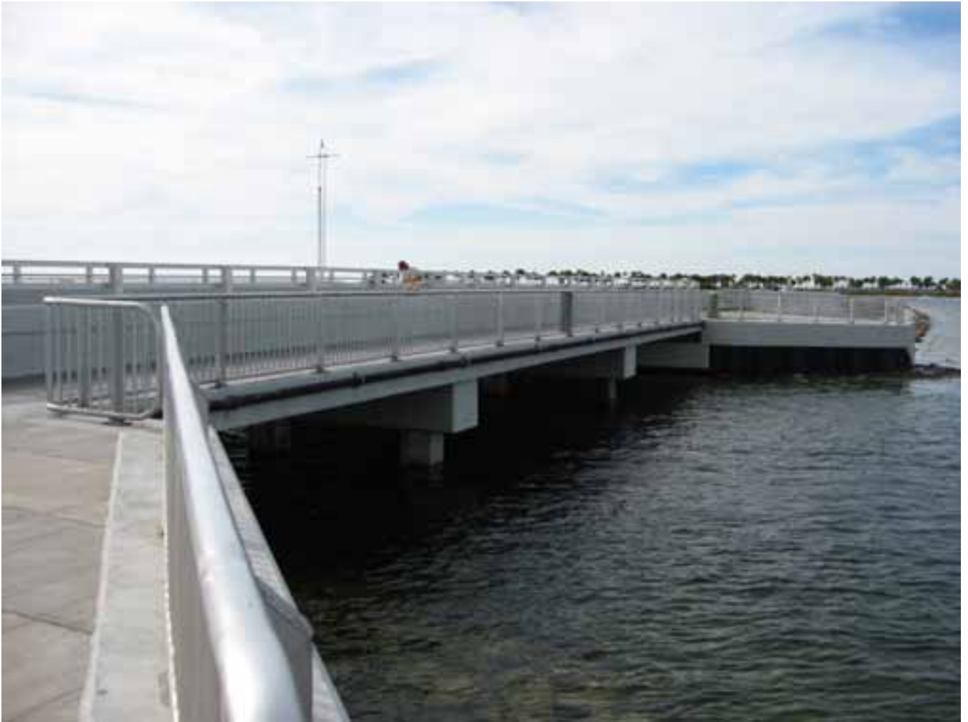
The Fred Howard Park Bridge is a three-span precast, prestressed concrete slab bridge using prestressed concrete piles and cast-in-place pile caps. It was constructed in 2010.