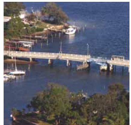
Beckett Bridge over Whitcomb Bayou is a bascule bridge constructed in 1922. Its cast-in-place concrete slab approaches were constructed in 1965 on precast concrete piles that remain in good condition.

The Mango Avenue Bridge over Bear Creek is a two-span, cast-in-place concrete slab bridge constructed in 2009. It has prestressed concrete piles and cast-in-place pile caps. The appearance of approach slabs are abutments confined by sheet piling.