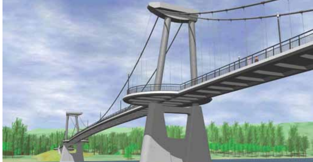
For the Fort Edmonton Footbridge in Edmonton, Alberta, Canada, a post-tensioned, precast segmental concrete deck system was selected for the suspended superstructure, to minimize field erection time and to provide for improved construction quality and long-term durability.

Also, different approaches such as adaptive bridge design, design for deconstruction, or some structure reuse strategies can help preempt costly