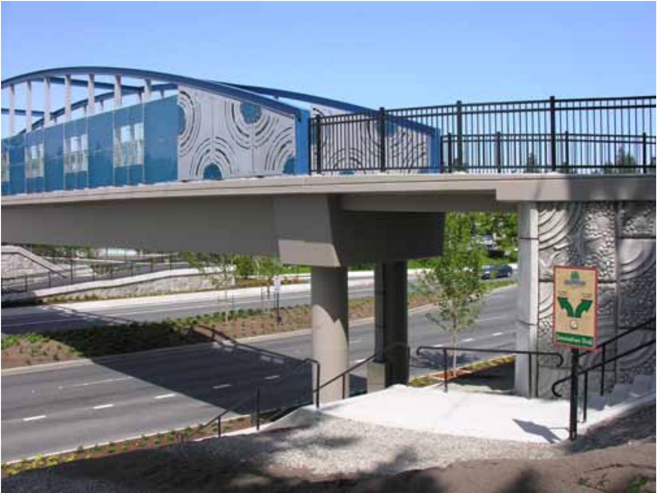
The Aurora Avenue Bridge in Shoreline, Wash. incorporates public art into the concrete walls to enhance the aesthetic appeal of the bridge approaches.