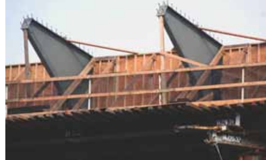
The steel fins that support the 14-ft-long cantilevers are shown in the structure and in place during construction of the concrete formwork.